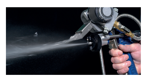
Century with cutter