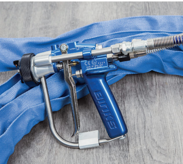
BÜFA®-Tec Pistol Century (Item no. 029-2500)

The ES1 has a long service life because of its robust technology and simple, fast maintenance!