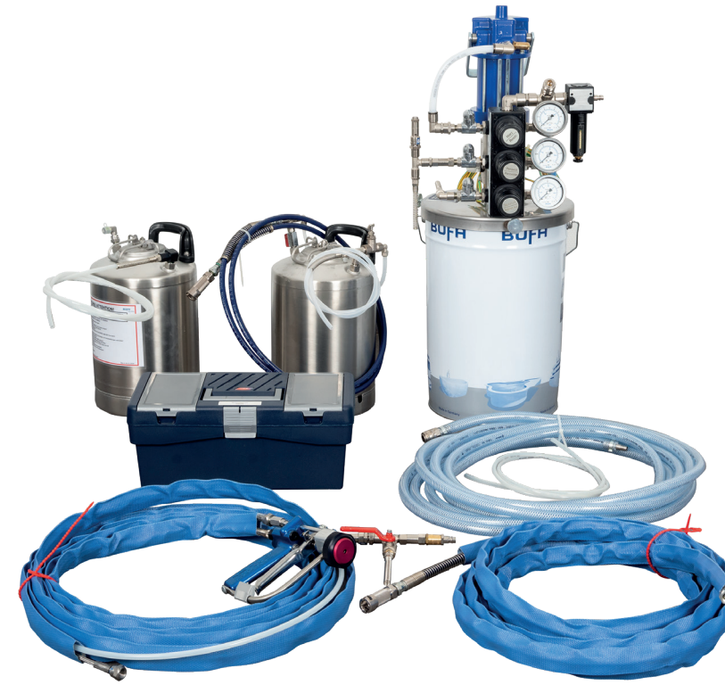
BÜFA®-Tec GSU ES1 Multi (Item no. 028-0184) with rinsing tank, peroxide tank and tool box

It combines all the advantages of the ES1 with the possibility of a quick colour change.