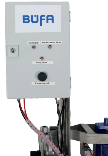
BÜFA®-Control-Peroxide Monitoring (Item no. 028-0974)