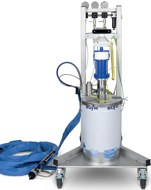
BÜFA®-Tec GSU ES1 EM Easy Lift (Item no. 028-0352)

BÜFA®-Tec GSU ES1 Easy Lift (Item no. 028-0352)