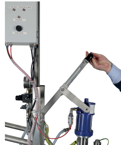
Ergonomic operation with BÜFA®-Tec ES1 Easy Lift mechanism