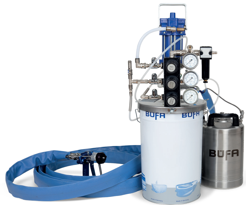
BÜFA®-Tec GSU ES1 EM (Item no. 028-0182) with peroxide tank and Century