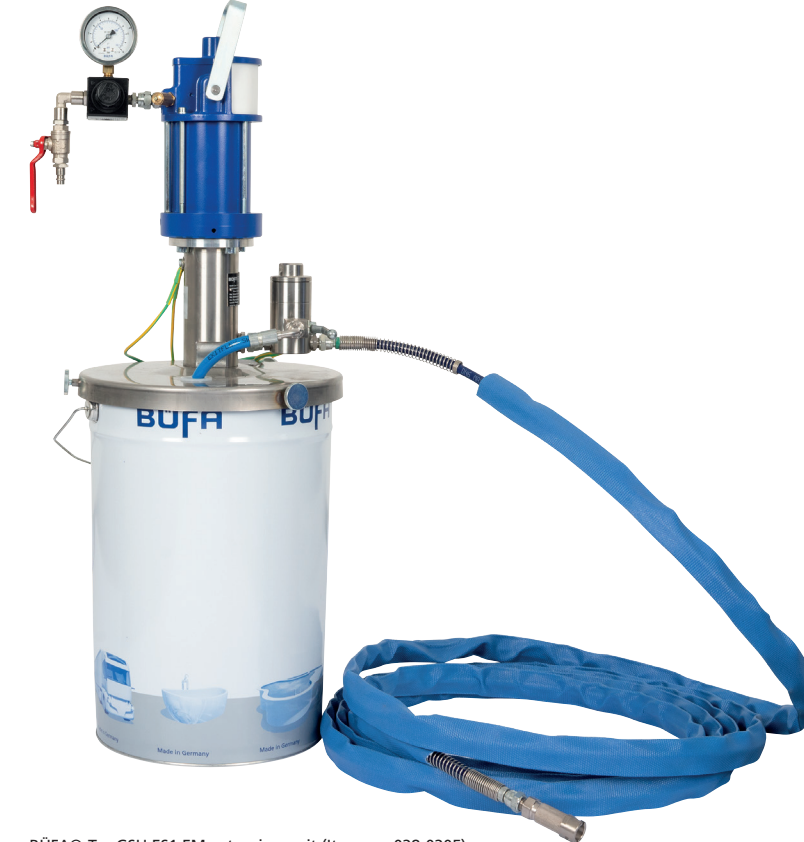
BÜFA®-Tec GSU ES1 EM extension unit (Item no. 028-0205)